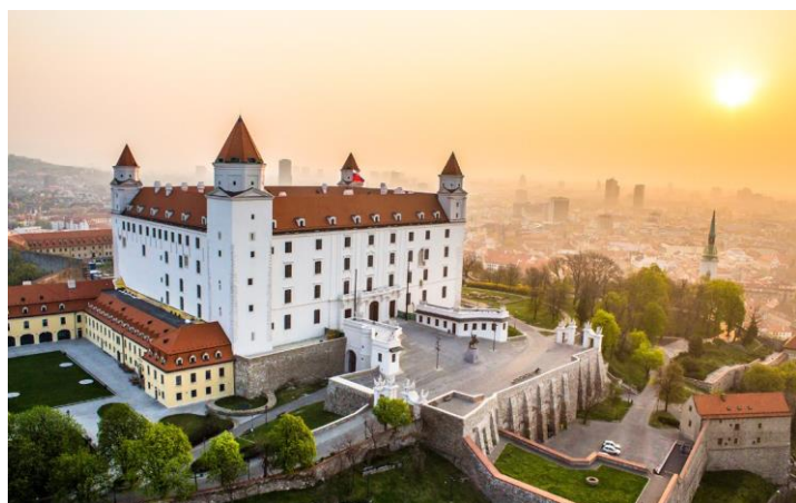
Bratislava – Capital of Slovakia