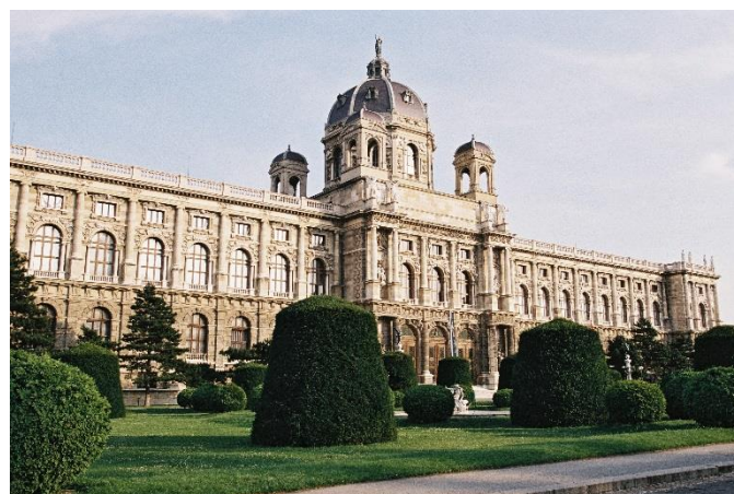
Vienna – Capital of Austria

It is our pleasure to invite you to the Joint International Week 2020 at The University of Economics in Bratislava, Slovak Republic , and at WU (Vienna University of Economics and Business), Austria , which will take place from 23 to 27 March 2020 . This event aims to bring together staff from both universities and partner institutions in order to strengthen international networks and exchange ideas.